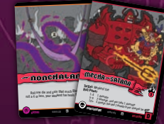
QUALITY + DELIVERY