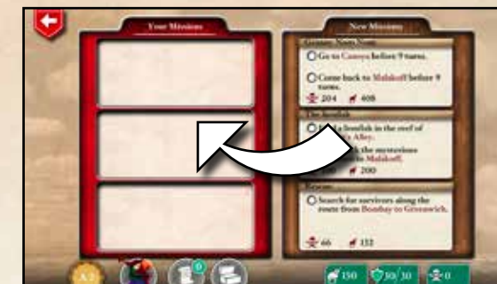
Port Barrack screen, drag and drop missions from right to left to accept them.

Vengeance Mission When you fail or abort a mission, vengeance missions may be offered to other players. These missions are always combat missions.